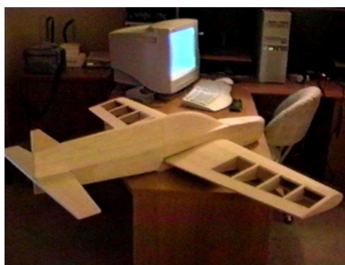
Framed Morris Hobbies BalsaNOVA