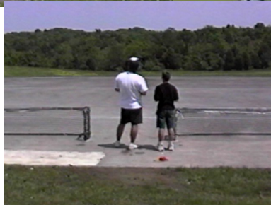
The club president volunteering some time to a new pilot.