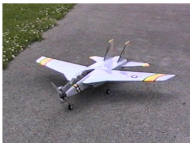
Just completed Great Planes F-14 sporting a SuperTigre 90. It has yet to be flown.